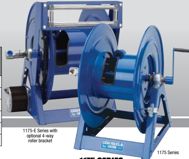
1175-E Series with optional 4-way roller bracket